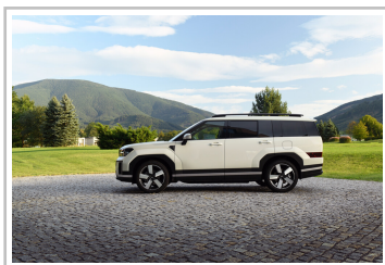
Hyundai Santa Fe.