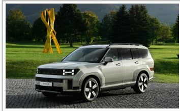
Hyundai Santa Fe.