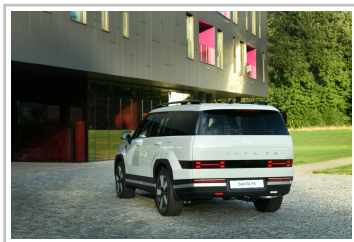
Hyundai Santa Fe.