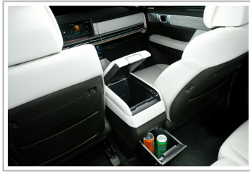
Hyundai Santa Fe.