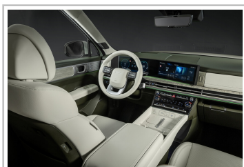
Hyundai Santa Fe.